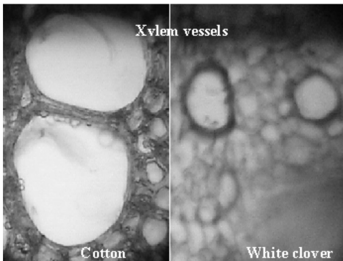
Plate 1. Micrograph showing comparative sizes of a typical group of the largest xylem vessels in the roots of high-P cotton (80 \mu\text{m} in diameter) and high-P white clover plants (30 \mu\text{m} in diameter) at the same magnification, 90x.

note that the size of the xylem vessels appears to be dependent on the plant species and root thickness. For example, the very thick tap-root of a cotton plant had xylem vessels with much larger diameters (80 \mu\text{m} ) than those in nodal roots of white clover (30 \mu\text{m} ) (Plate 1, Table 1).